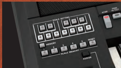
Scale Tuning and Scale Setting Buttons