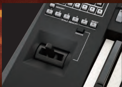
Joystick with assignable function

Not only essential "Pitch Bend" and "Modulation" parameter, but also other parameter, such as Filter, Track-Mute, and more can be assigned and changed in an instant. This feature will add another perspective to your performance. Add a unique flavor to your performance!