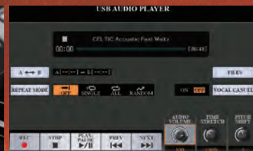
USB Audio Player