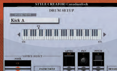
Drum Setup display

In the Style Creator, you can edit various parameters of Drum kit in detail, and you can merge the favorite "instrument" with various from Drum kit. Enjoy playing Styles with your unique Drum kit!