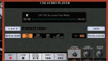
USB Audio Player